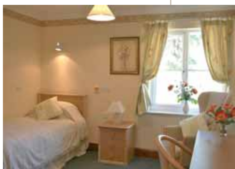
A typical bedroom at Tara's Retreat