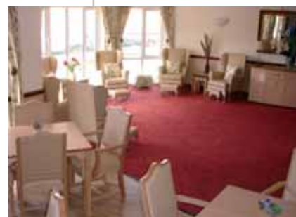
One of the lounge/ dining rooms at Tara's Retreat

The Manager at Tara's Retreat, High Street, Sandridge, Hertfordshire AL4 9DQ T: 01727 850527 F: 01727 853927 E: tarasretreat@bmcarehomes.co.uk www.bmcare.co.uk