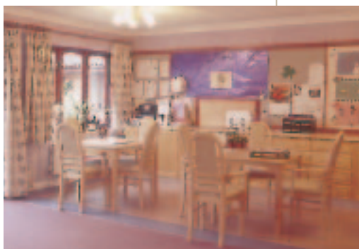
The activities room at St Lukes