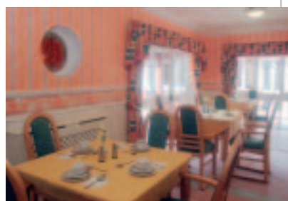
The dining suite at The Lodge